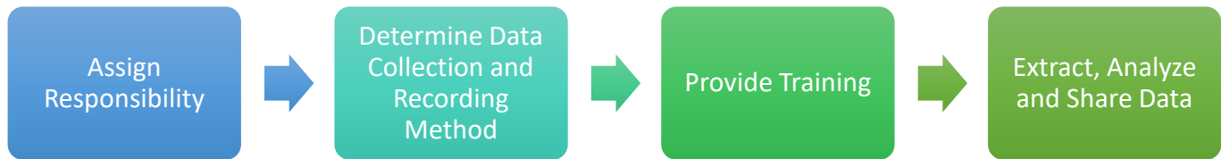
Figure 2: Steps for implementing equipment problem coding

Figure 2 suggests the major steps a utility can use to implement this process.