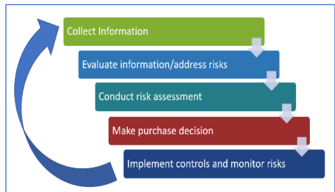
Supply Chain Security Assessment Model

The criteria and questionnaire support the first three steps in the assessment model. The graphic to the right depicting the model provides a streamlined view of the process; however, it is important to review the detail for each of the steps so the intent of the model is not misconstrued and full value of the model can be realized. A full, yet concise, description is provided in the “Supply Chain Security Assessment Model,” and the basic actions for each step are provided here.