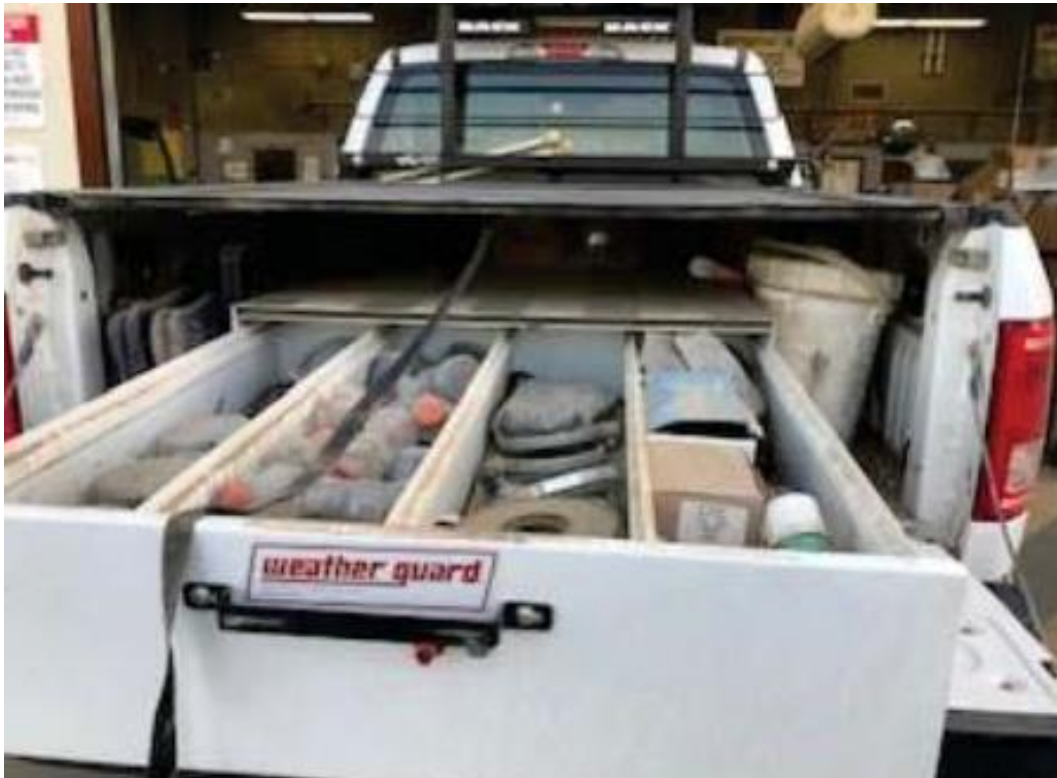
Material in bed of truck